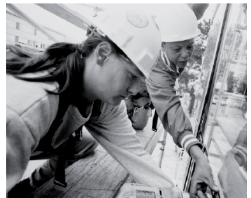
보상청구의 집행을 감독합니다.