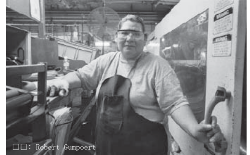
업무상 재해 및 질병의 영향을 최소화합니다.

즉시 상사에게 얘기하십시오. 재해나 질병이 (건염 또는 청력 손실처럼) 서서히 진전될 경우, 그것이 업무 때문에 생겼다는 것을 알게 되거나 업무 때문에 생겼다고 생각하는 즉시 보고하십시오.