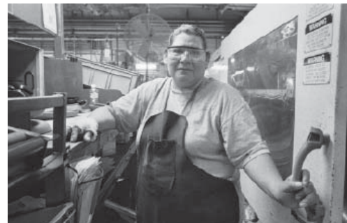
Giảm thiểu tác động của các trường hợp bị thương và bị bệnh liên quan đến công việc

Thông báo cho cấp trên của bạn ngay lập tức. Nếu bạn bị thương hoặc bị bệnh tiến triển từ từ (như viêm gân hoặc mất thính lực), hãy báo cáo ngay khi bạn biết hoặc cho là do công việc của bạn.