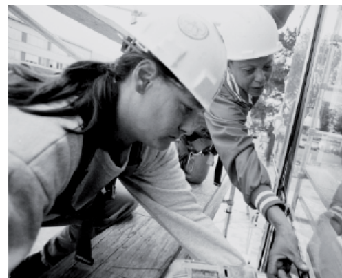
Giám sát việc quản lý yêu cầu bồi thường bảo hiểm