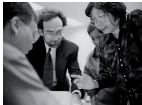
Giúp giải quyết các bất đồng về quyền lợi bồi thường tai nạn lao động