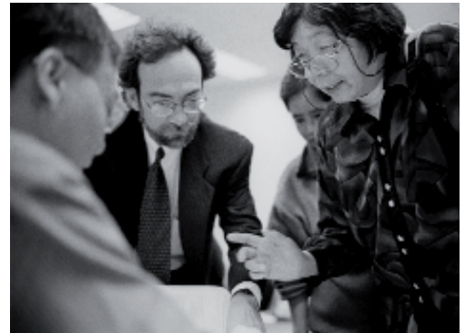
근로자 산업재해 보상 급여에 대한 분쟁 해결을 돕습니다.